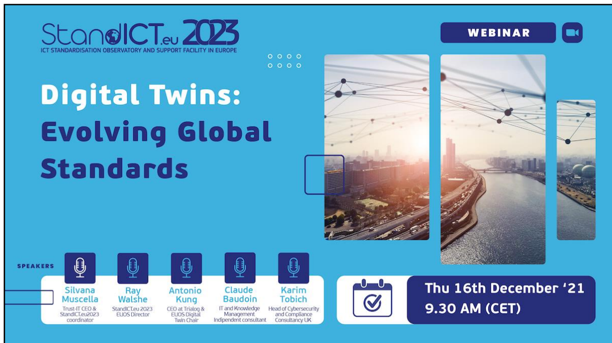
Figure 3 - Promotional Banner of 6 th StandICT.eu 2023 “Walk & Talk” Webinar

The event featured the following list of speakers: