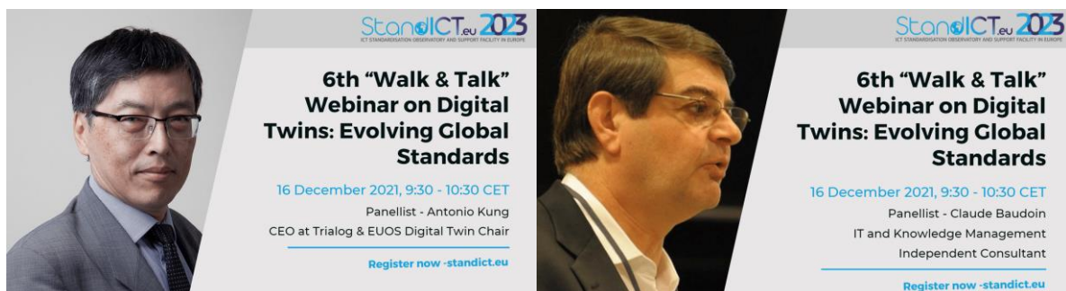
Figure 4 - Personal Twitter Cards prepared for the #6 “Walk & Talk” Webinar

The Webinar was bolstered by the usual Social Media and Stakeholder campaign, plus a tailored last-minute Newsletter was sent 24 hours prior to the actual start of the event to prompt the StandICT.eu community to sign up and join the event. Below are some examples of personalised Twitter Cards leveraged during the live coverage of the webinar on Twitter.