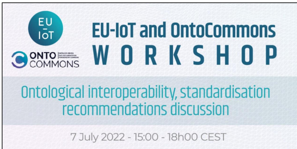
Figure 10 - Promotional Banner of StandICT.eu 2023 & OntoCommons Joint Workshop

The event featured the following list of speakers: