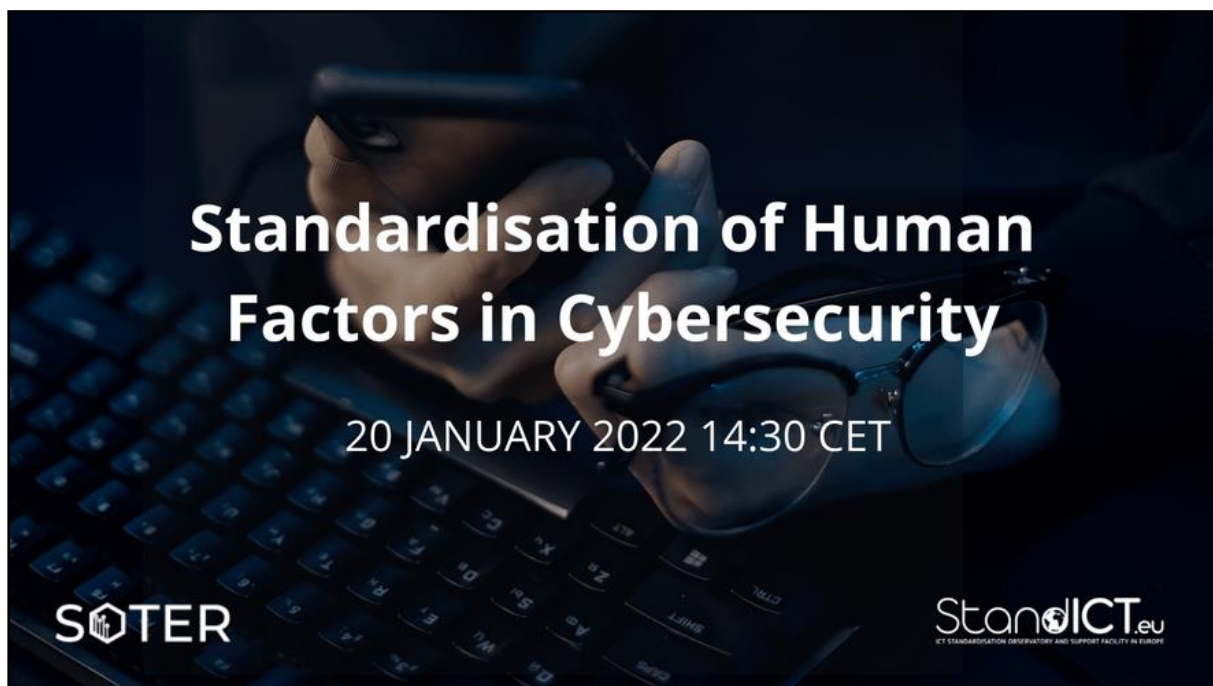
Figure 5 - Promotional Banner of StandICT.eu 2023 & SOTER Workshop

The StandICT.eu Workshop “Standardisation on Human Factors in Cybersecurity” was organised in cooperation with the SOTER H2020 project on the 20 th of January 2022, focusing on human factors in cybersecurity, assessment, threats and competencies with the participation of experts & stakeholders to debate critical elements for future standardisation of human factors in cybersecurity.