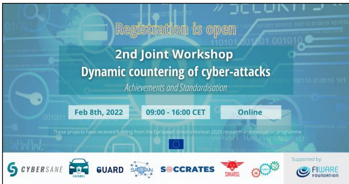
Figure 8 - Promotional Banner of StandICT.eu 2023 & CyberSane Joint Workshop

The StandICT.eu Workshop “Dynamic Countering of Cyber-attacks | Achievements and Standardisation” was organised in cooperation with the H2020 CyberSane project and took place on the 08 th of February 2022. The Workshop gathered 7 different H2020 projects active in the “Dynamic countering cyber-attack” topic to share the main advancements of each project, create synergies and set a common ground for standardisation activities, and, lastly, to discuss the different approaches to the common problem of attack detection and situational awareness in different environments.