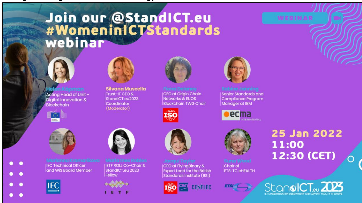
Figure 6 - Promotional Banner of 7 th StandICT.eu 2023 “Walk & Talk” Webinar

The seventh Webinar of the “Walk & Talk” series took place on the 25th of January 2022. The webinar was an invaluable opportunity to give a space to esteemed representatives from various European and International Standards Developing Organisations to discuss their effort, achievements and current activities in their respective ICT technological domain, with a view to demonstrate the increasingly stronger linkage between technology and women.