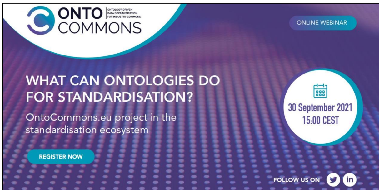
Figure 1 - Promotional Banner of StandICT.eu 2023 & OntoCommons Workshop

One of the Workshop’s main objectives was to create synergies and cooperate with relevant bodies and initiatives, particularly European and international standardisation bodies. The event also represented the opportunity to demonstrate how the Ontology domain can help tackle many of the challenges identified in the European Strategy on Standardisation by contributing to the standards harmonisation and interoperability and to showcase how StandICT.eu 2023 is supporting work to align existing ontologies and ultimately contribute to filling the gap in ontology-based Standards to support EU Policy objectives, through its funded fellows.