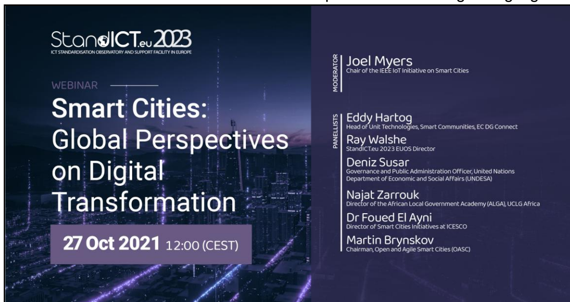
Figure 2 - Promotional Banner of 5th StandICT.eu 2023 “Walk & Talk” Webinar

The fifth Webinar of the “Walk & Talk” series took place on the 27th of October 2021. The webinar mostly focused its discussion on what knowledge and tools are required for nations and local authorities to take the next steps in the Smart Cities domain, to build a society that benefits from digital transformation in cities, through standards, educational and technological toolkits, and cooperation. The panel reflected also at lessons learnt from COVID-19 and what is required to combat a growing digital divide.